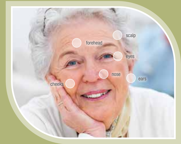
Xoft Electronic Brachytherapy (eBx)

Patients can learn more by going to: www.xoftinc.com/patients/patients_skin.html